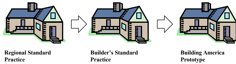
Figure 1. The prototype is evaluated relative to two base cases