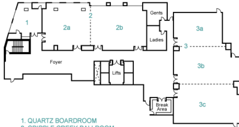
EMBASSY SUITES DENVER DOWNTOWN CONVENTION CENTER - SECOND FLOOR